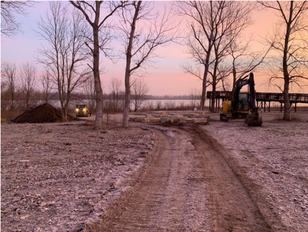
Limestone screening added and boulders being arranged