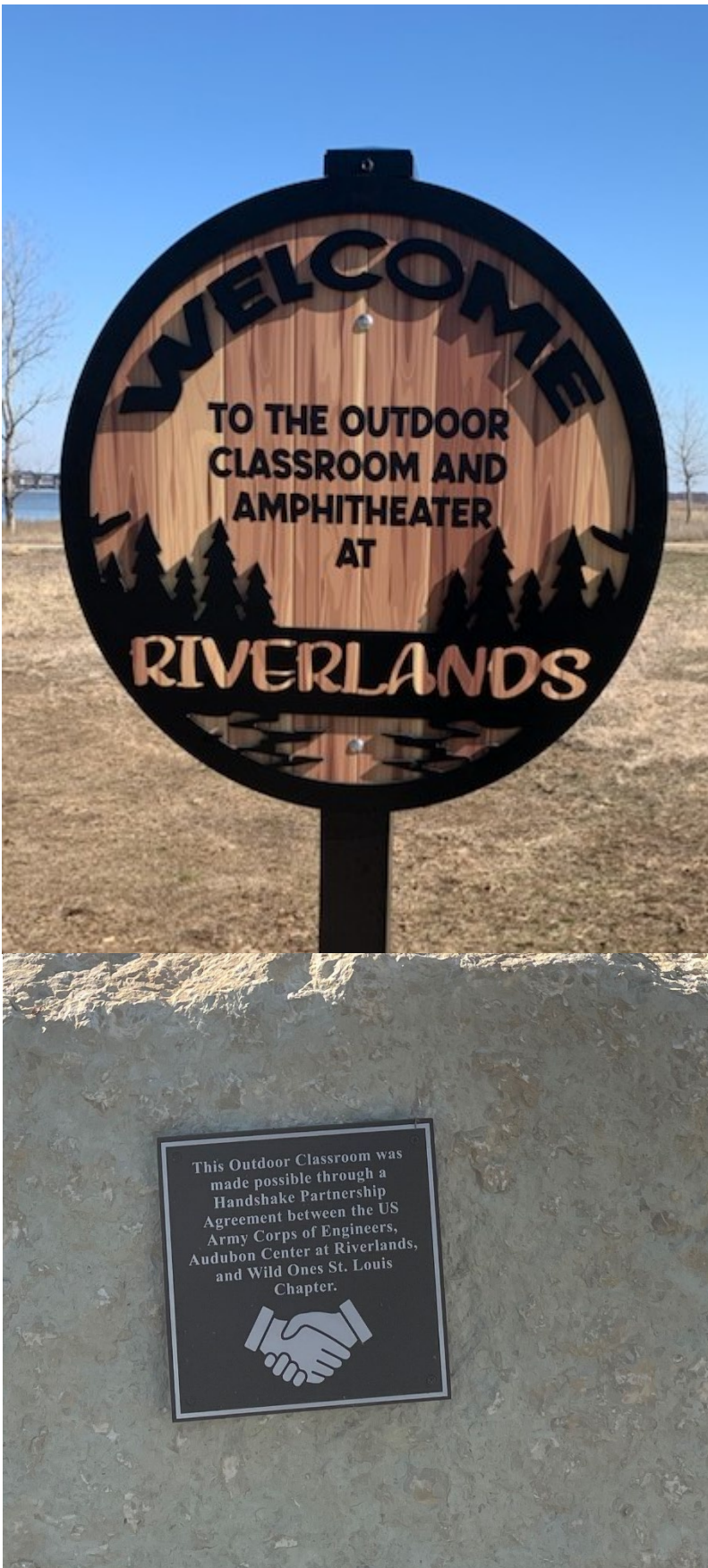
Custom signage from a local sign shop