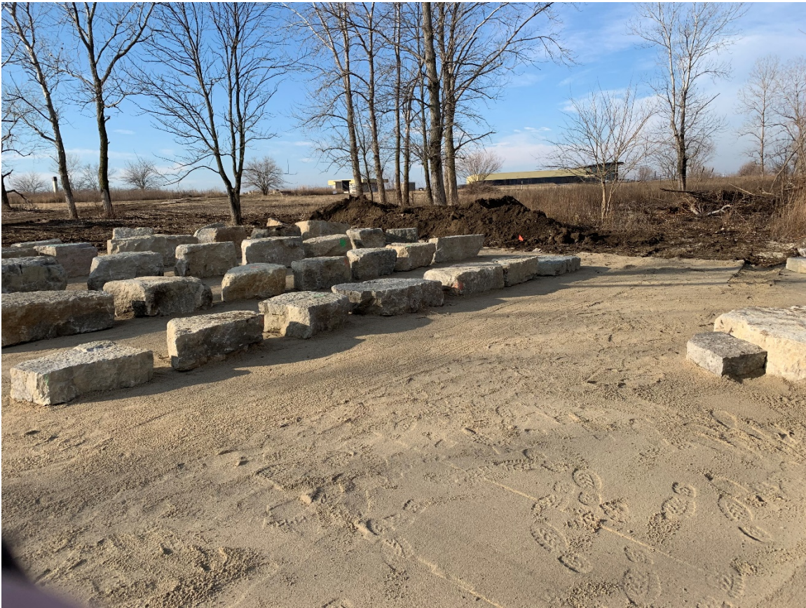
Completed footprint and boulder arrangement