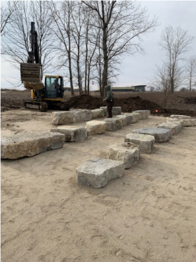
Arranging boulders to allow for tiered seating