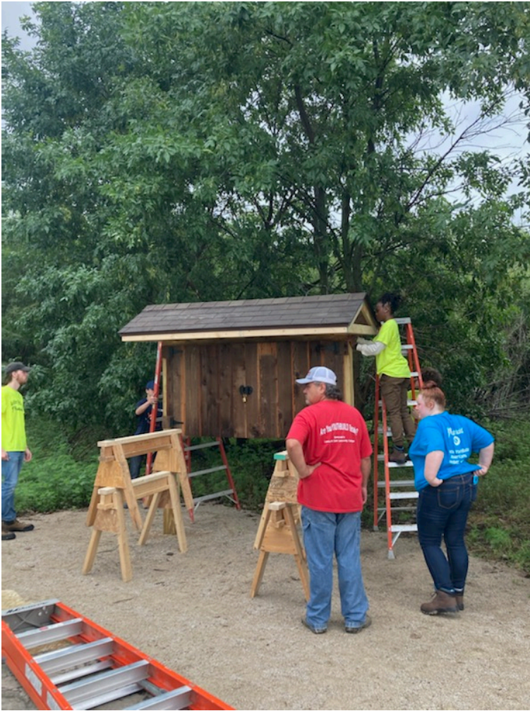
Students and teachers from YouthBuild designed, built, and installed a custom outdoor blackboard