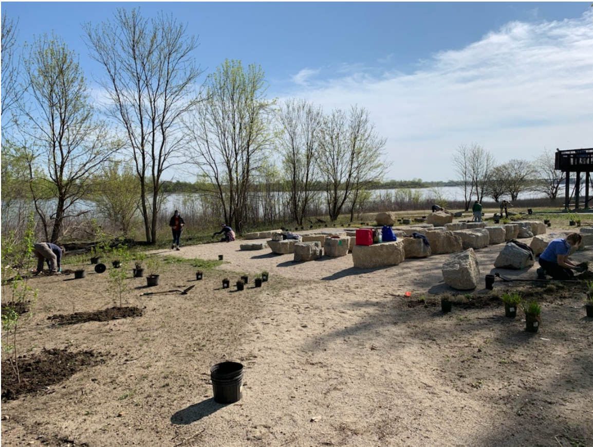
Volunteers and organizers from Wild Ones St. Louis Chapter and the Audubon Society gathered to plant over 200 potted native plants