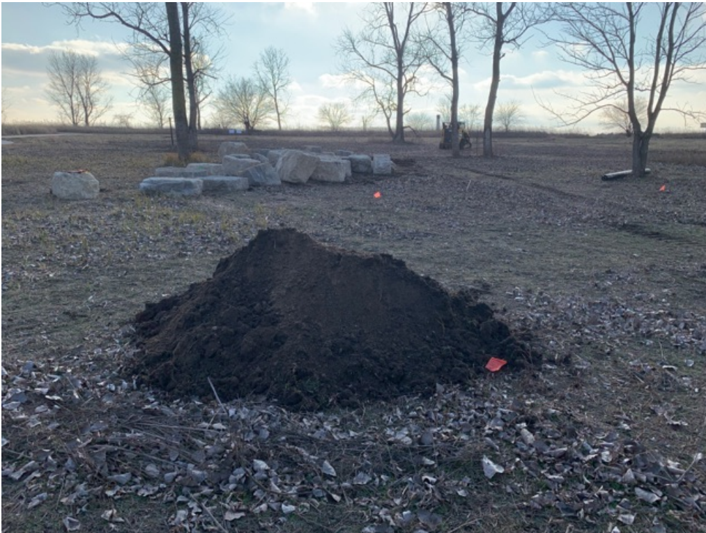
Site cleared and graded; boulders delivered

The project area was cleared of vegetation and brought to a suitable grade for accessibility. The amphitheater footprint was filled with crushed CA-6. Boulders were brought in to provide seating and arranged for best visibility. Native plants were planted by volunteers from Wild Ones St. Louis Chapter. Custom signs were purchased and installed. Although not an original partner for this project, we were able to partner with YouthBuild to design, build, and install a custom outdoor chalkboard. An Eagle Scout also added custom weaving structures. These will be utilized by future Rivervision students for collaborative activities.